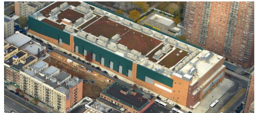
NY MTA Mother Clara Hale bus maintenance facility