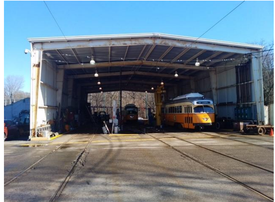
Mattapan car house, Boston