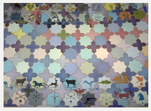
Joyce Kozloff "New England Decorative Arts" Ceramic tile mural installed over the entrance to the bus area