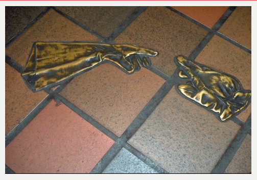
Mags Harries "The Glove Cycle" Narrative bronze sculptures located throughout the station