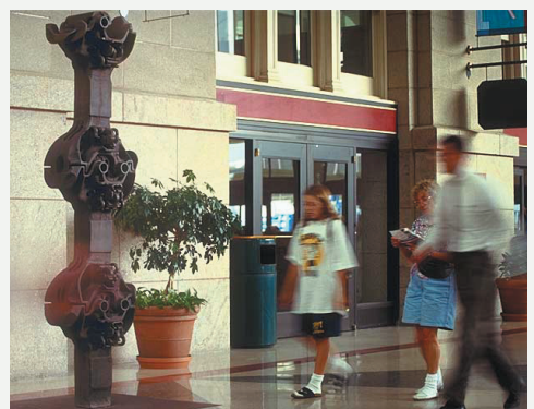
Mayer Spivak "Muscle Bound for Miami" Sculpture located in the Amtrak waiting area