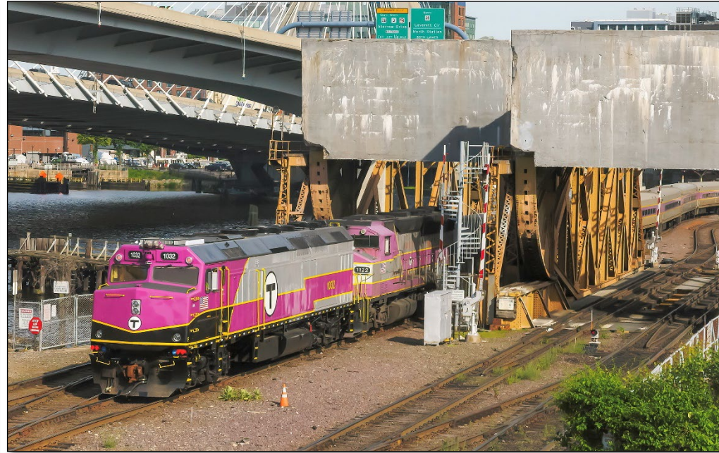
View of outbound train crossing Draw One Bridge