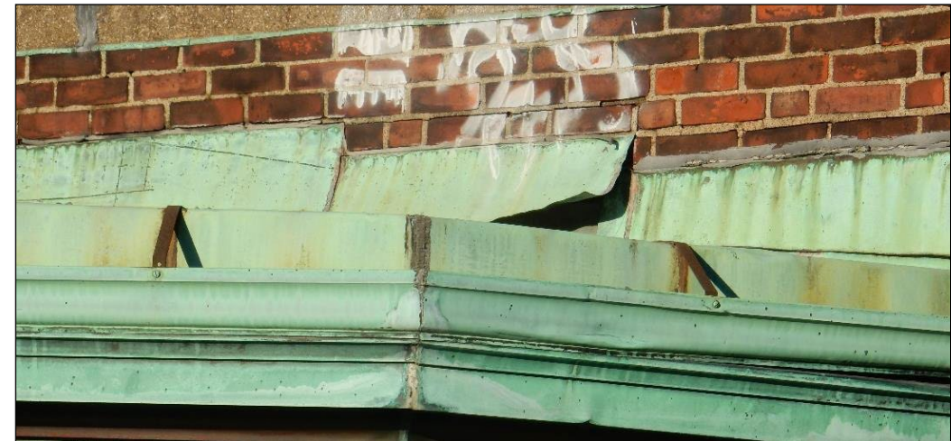
Bent and damaged copper flashing