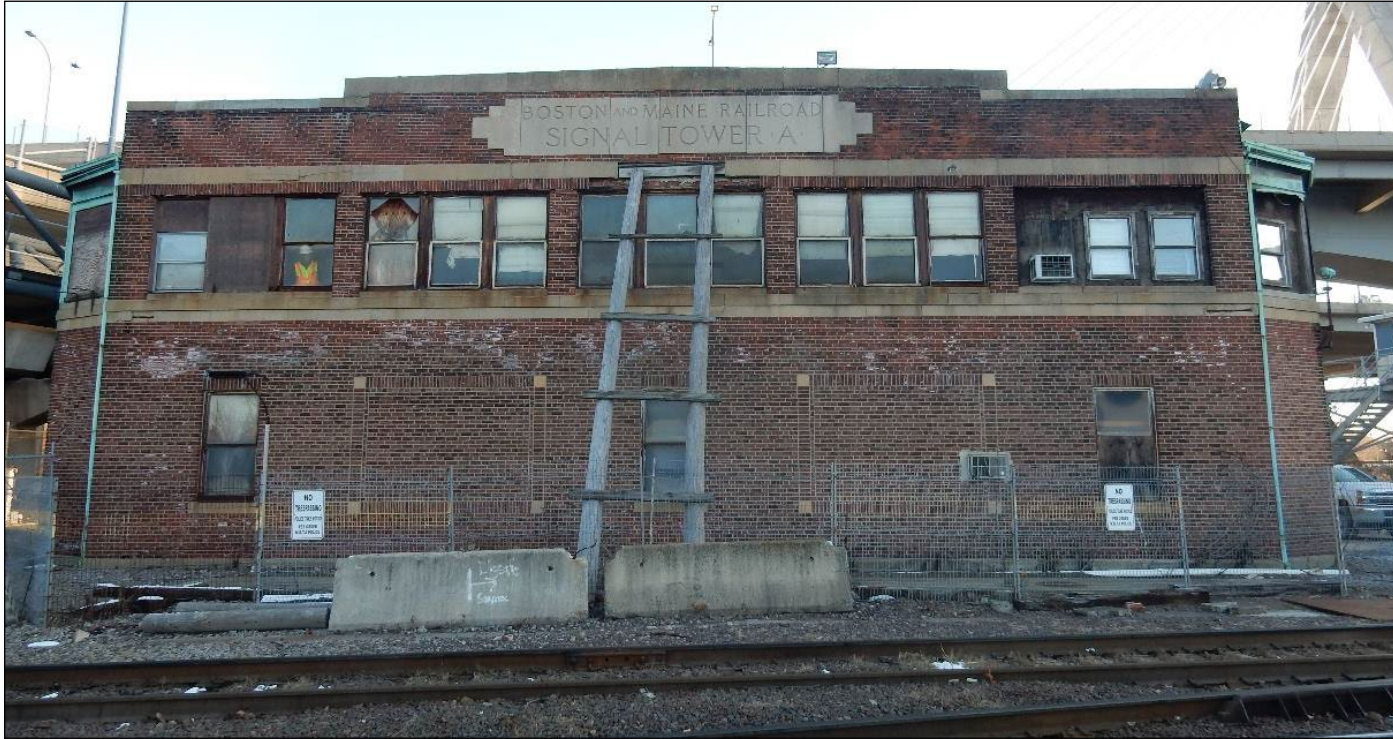
Existing Control Tower A building, currently out of service