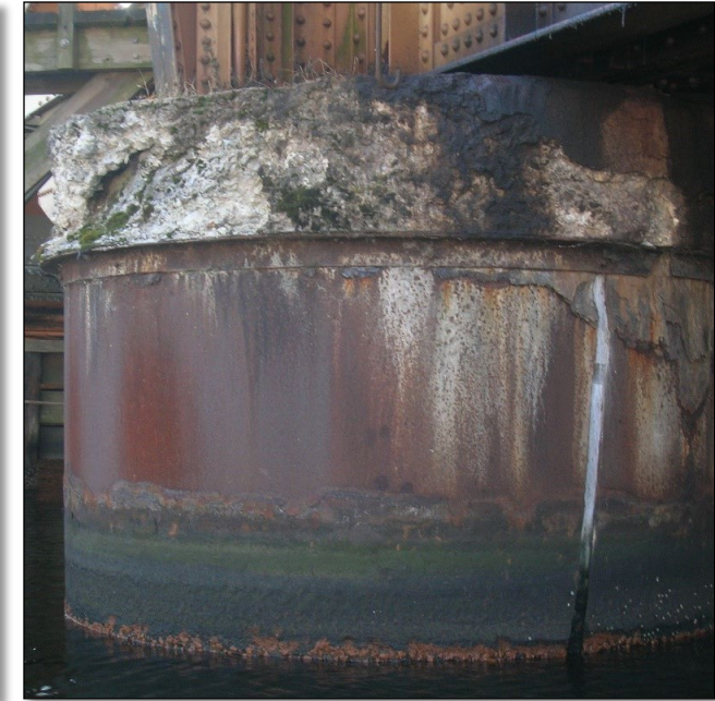
Picture of Bridge Caisson showing deterioration