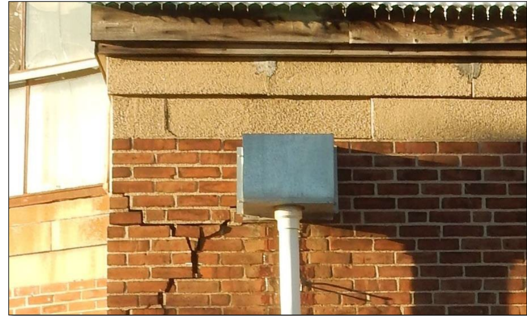
Severely cracked and displaced brickwork