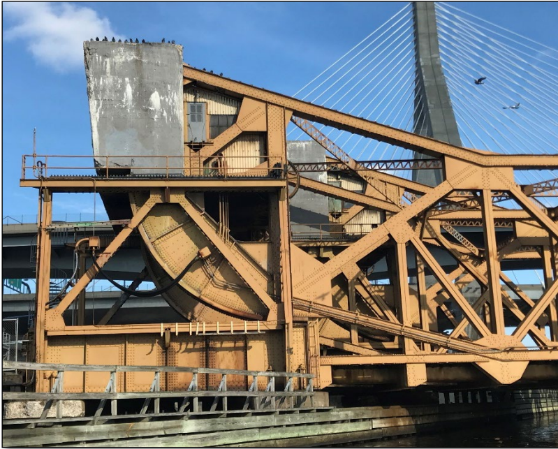
View of existing bridge looking toward Zakim Bridge