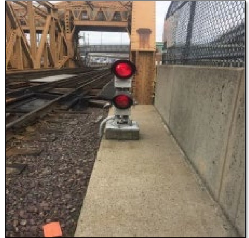
Typical existing signal on Draw One