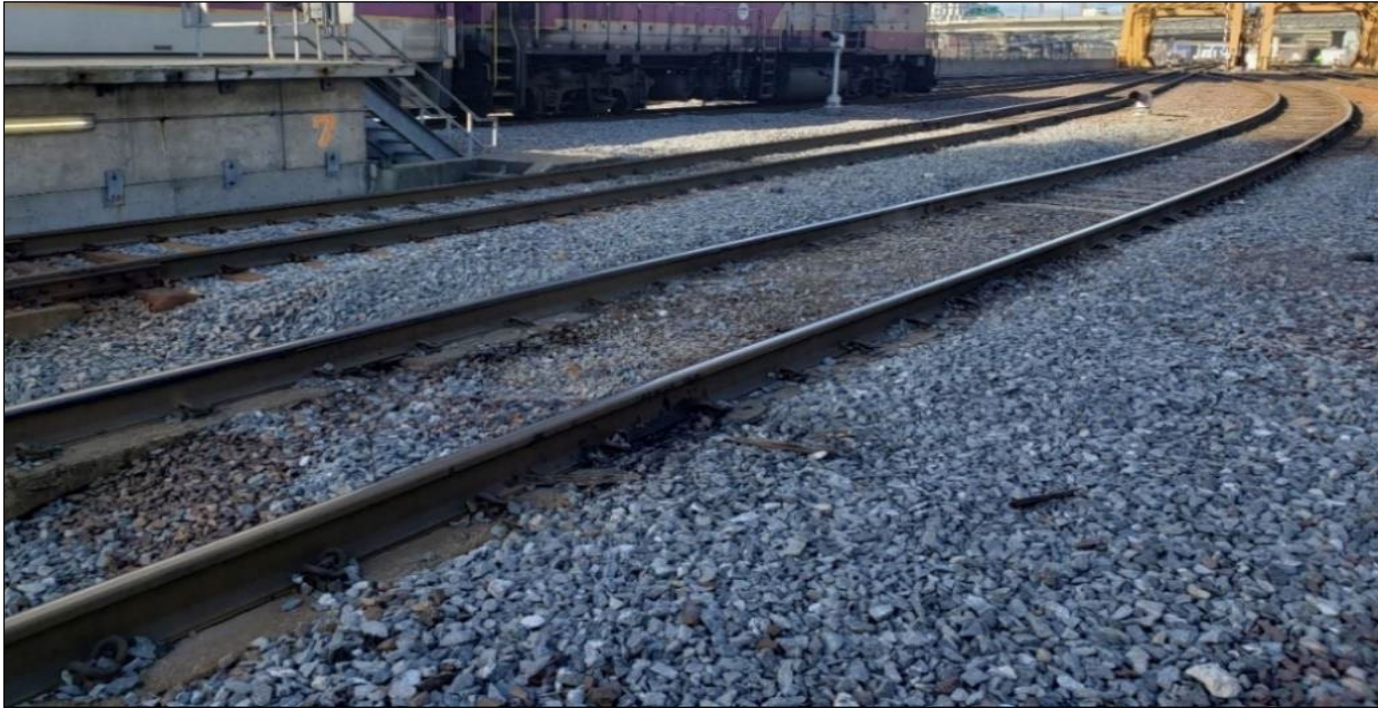
Several types of fasteners are often intermixed throughout the terminal area