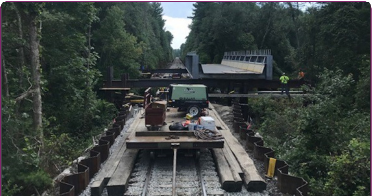
Assembling the Assonet River Bridge

Once over the track, the bridge was lowered onto two carts, each with four railroad axles. Each cart also carried a removable portion of the temporary beam that would be used to support the bridge and slide it sideways at its final location.