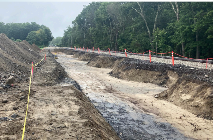
Preparing the site of Freetown Station

The construction numbers are impressive: 32% of the rail has been replaced or upgraded on the Fall River line, and 9% on the New Bedford Main Line/Middleborough Secondary. Sheet piling and pile walls are being installed, with more than 10,000 linear feet on Fall River and 3,900 on New Bedford/Middleborough. More than 175 workers are working at sites along the right-of-way (ROW). Bridges and culverts are being replaced and grade crossings upgraded.