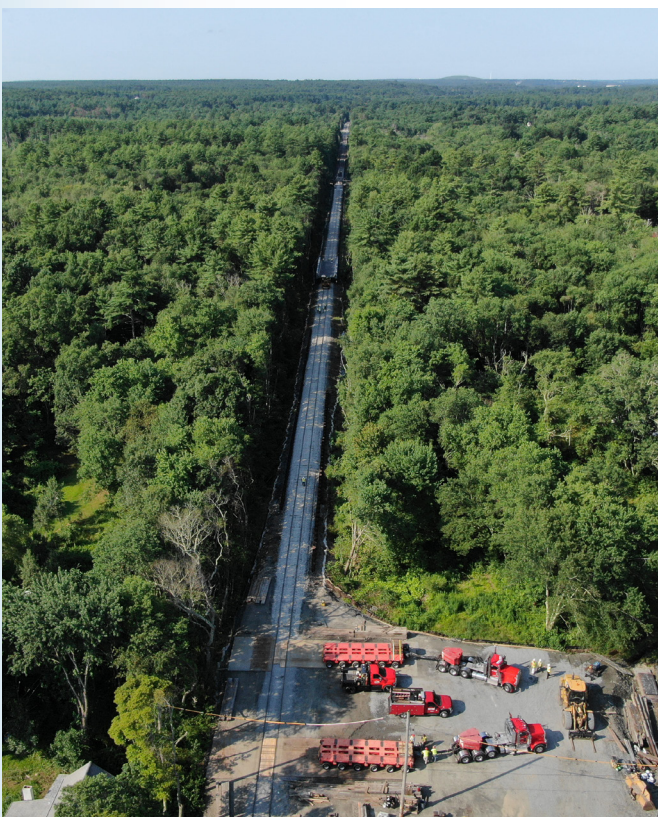
Rolling the Assonet River Bridge to its location

To bring commuter rail service to South Coast Rail (SCR), the MBTA is in the process of replacing or rebuilding seven railroad bridges along the Fall River Secondary. Railroad bridge construction is always a major undertaking, but the challenges are multiplied when a bridge must be replaced in a relatively inaccessible and environmentally sensitive location.