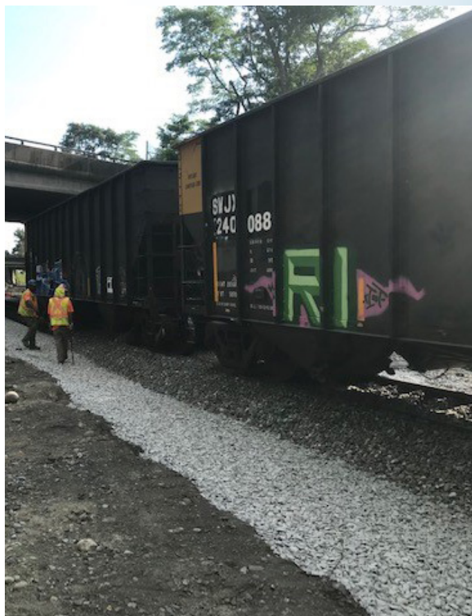
Ballast being delivered by train car at the Route 79 Bridge